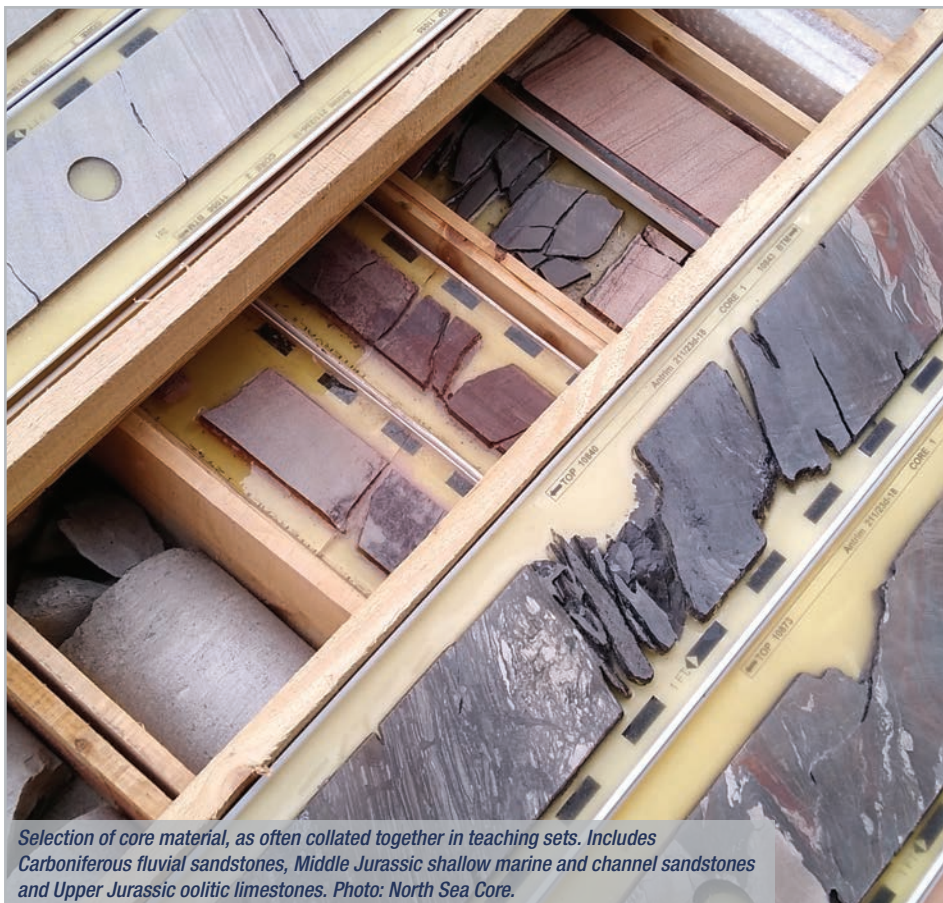
Selection of core material, as often collated together in teaching sets. Includes Carboniferous fluvial sandstones, Middle Jurassic shallow marine and channel sandstones and Upper Jurassic oolitic limestones.

► These resources include a range of Exploration Boxes. Each box contains five samples that support the chosen geological theme of the box, together with an explanation sheet. Our first box explored the petroleum geology of the North Sea and was generously sponsored by the Petroleum Exploration Society of Great Britain, the Petroleum Group of the Geological Society of London and the Oil and Gas Authority. Our second box explored the depositional system of the Middle Jurassic delta in the Northern North Sea, which provides the key reservoir for the Brent oil field. Named the BRENT Group, the Broom, Rannoch, Etive, Ness and Tarbert Formations record the progradation, deltaic, coastal plain and transgression of the delta. Future boxes are planned and may explore topics ranging from the depositional environments of the Southern North Sea to Geothermal Energy.